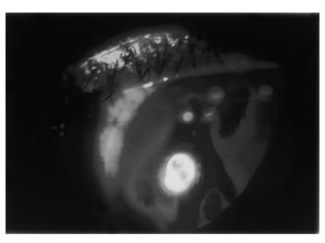
Figure 2. (Kymionis) Slitlamp photograph with retroillumination shows iris perforation.

keratomileusis was performed to correct the residual astigmatism using the automated Summit Krumeich-Barraquer microkeratome (Alcon) with a 130 \mu m plate and the Aesculap-Meditec MEL 70 excimer laser. The procedure was uneventful, and no intraoperative or postoperative complications related to the previous AK incision or LASIK were observed.