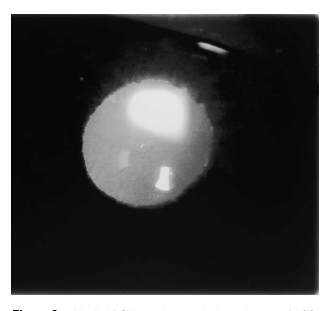
Figure 3. (Kymionis) Slitlamp photograph shows the area of ACO.

After 3 months, the UCVA was 20/25 and the BCVA was 20/20 in both eyes; the manifest refraction was -0.75 \times 145 in the right eye and +0.50 -0.75 \times 160 in the left