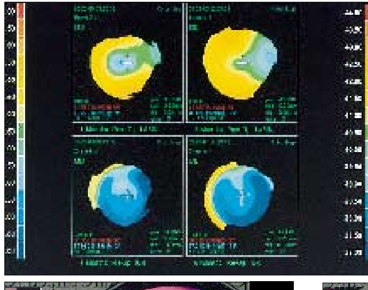
Figure 1. Four-map trend demonstrates topographic changes after LASIK (unstable steepening and eccentric displacement of the ablation zone) and after INTACS implantation (uniform increase in the optical zone, which remained stable over time).

from the limbus). Corneal thickness was measured at the incision site with ultrasonic pachymetry and the diamond knife was set at 70% of the peripheral corneal depth. A 1.2-mm radial incision was created and the floor of the incision was visualized using two Sinskey hooks and a Suarez spreader. Incision depth was checked with gauges and centration was verified. Two intrastromal pockets were created using a pocketing lever, stromal spreader, and clockwise and anticlockwise dissection glides. Two hemichannels (right and left) were created using clockwise and anticlockwise dissectors under suction created by a vacuum centering guide. The two PMMA segments (with thickness depending on the residual refraction) (Table) were implanted in the clockwise and counterclockwise tunnels, maintaining a space of 2.0 mm between their ends and